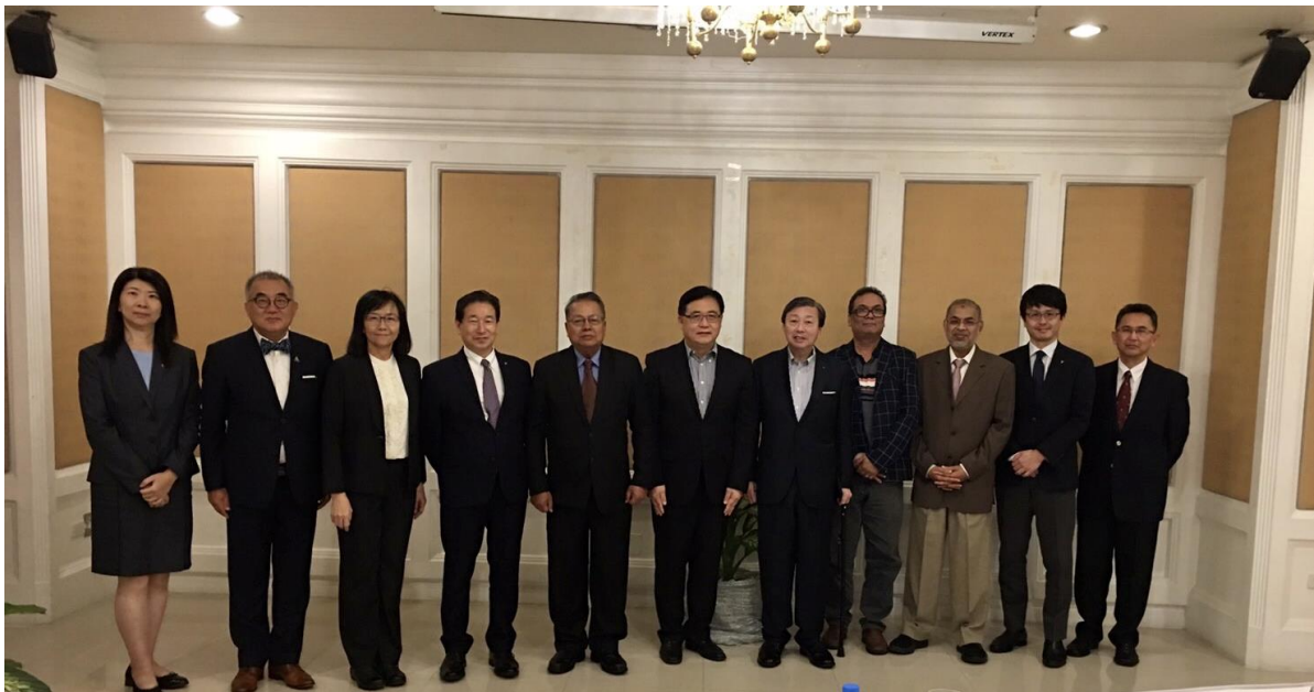
Second meeting of the SDG 11 Subcluster (24- 26.11. 2019, Royal Cliff Beach Resort, Pattaya)

Right now, the COVID-19 pandemic has more effect on big cities which change the way we live therefore the world after COVID-19 will not be the same, hence, there will have more reasons for us to work together more closely and effectively so that we can fulfil our responsibility to promote confidence and trust of the public and provide essential research, education, and activities to serve our society and communities.